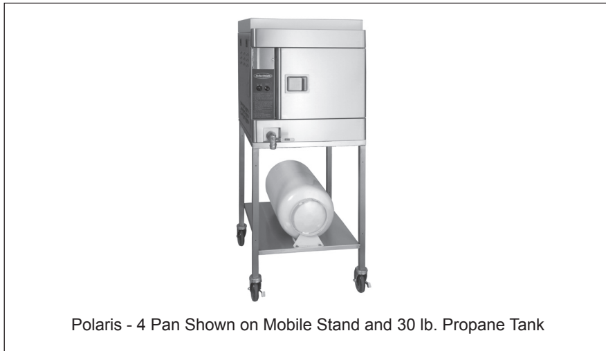
Polaris - 4 Pan Shown on Mobile Stand and 30 lb. Propane Tank